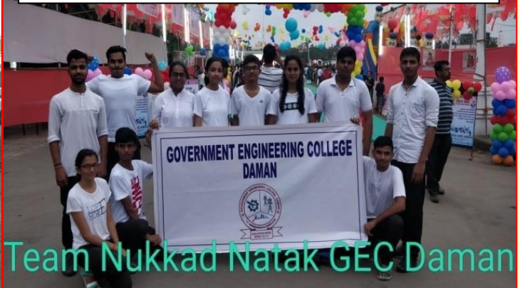
Nukkad Natak "Poshan Mela"