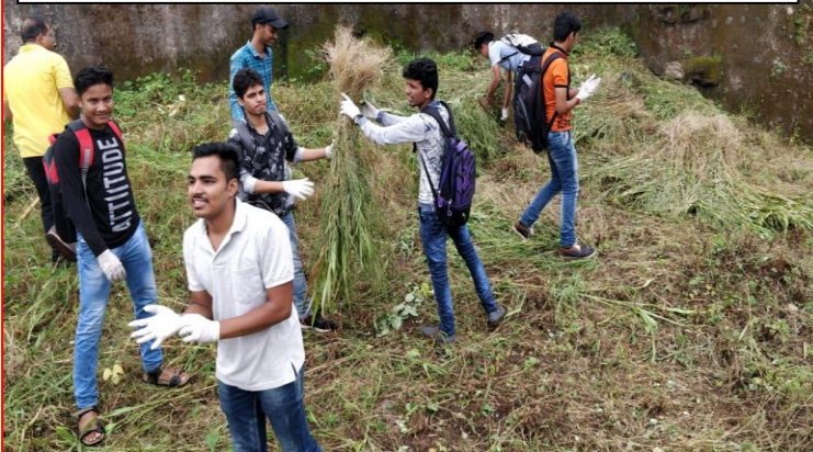
Cleanliness Drive Moti Daman Fort