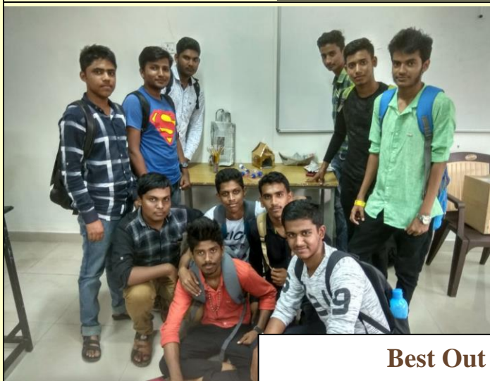
Best Out of Waste