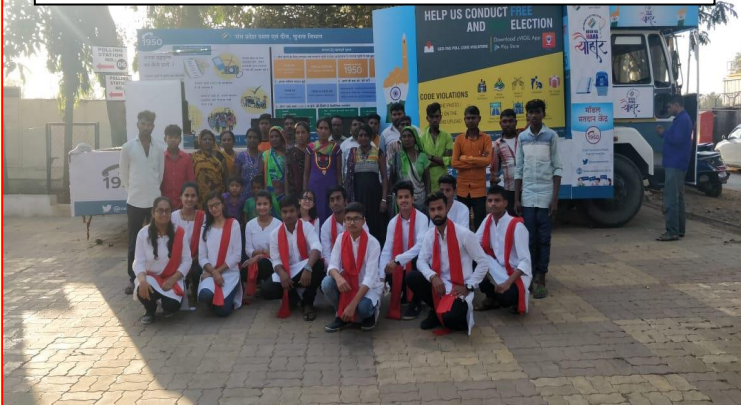
Election Awareness Programme