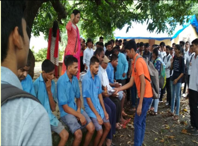
Blind School, Tatawadi