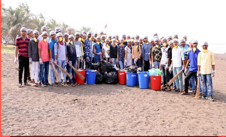
Cleanliness Drive Jetty Beach