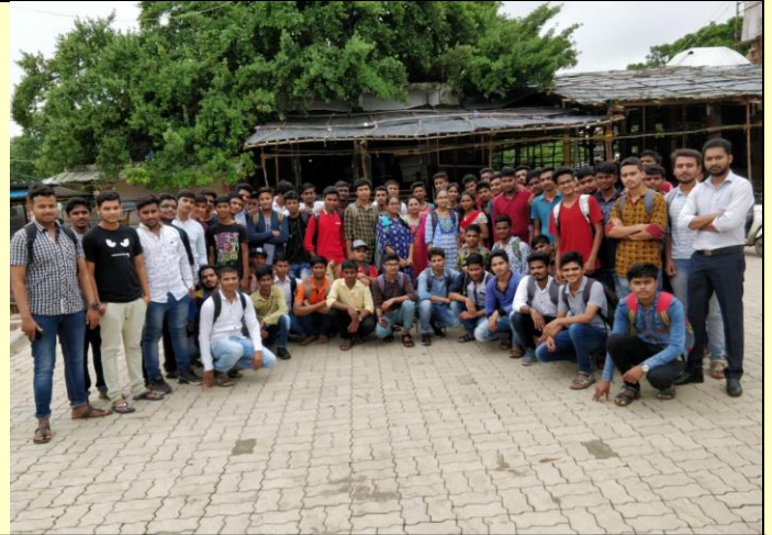
Hanuma Temple, Kalgao