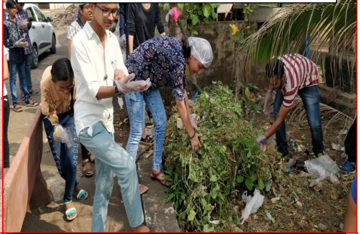
Cleanliness Drive Shamshan Bhumi