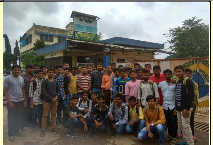
Kabra Industry, Khachigam

श्री माछी महाजन स्कूल और डॉक्टर शेरी में नुक्कड़ नाटक के माध्यम से मतदाताओं को किया गया जागरूक